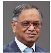
N.R. Narayana Murthy Founder, Infosys and Founder Catamaran Ventures