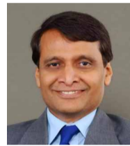
Suresh Prabhu Member of Parliament (Rajya Sabha) & India's Sherpa to the G20 & G7