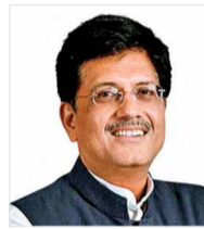
Piyush Goyal Minister of Railways and Minister of Commerce and Industry Government of India