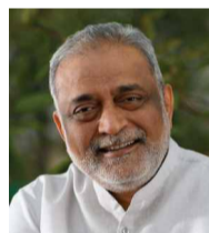
Kamlesh D Patel (Daaji) Author and Spiritual Leader