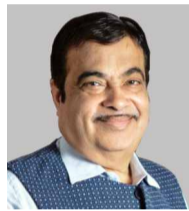
Nitin Gadkari Minister of Road Transport & Highways Micro, Small & Medium Enterprises Government of India