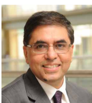
Sanjiv Mehta Chairman & Managing Director, Hindustan Unilever Limited