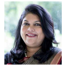
Falguni Nayar Founder and CEO Nykaa.com