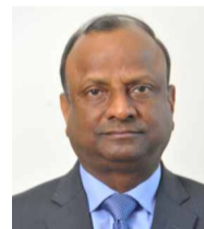
Rajnish Kumar Chairman State Bank of India