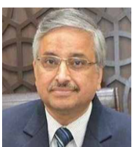
Randeep Guleria Director AIIMS