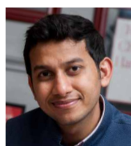
Ritesh Agarwal Founder and Group CEO OYO Hotels & Homes