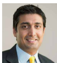
Rishad Premji Chairman, Wipro Limited