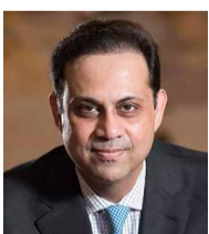
Sanjiv Bajaj Chairman and Managing Director, Bajaj Finserv Ltd.