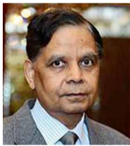
Arvind Panagariya Former Vice Chairman, NITI Aayog and Professor of Economics, Columbia University