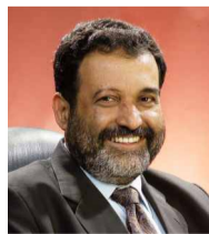
TV Mohandas Pai Chairman, Manipal Global Education Services Pvt Ltd.