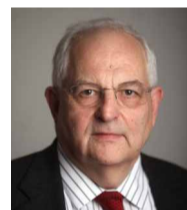
Martin Wolf Chief Economics Commentator Financial Times, UK